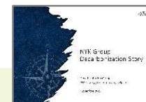
NYK Group Decarbonization Story

Refer to the following link for details.