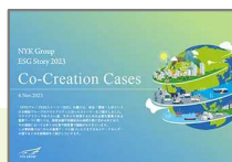
Co-Creation Case Studies